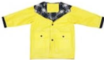
A coat if it is raining