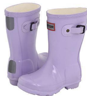
Wellies to leave at school (with your name written in)