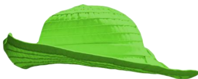
A sun hat if it's sunny!