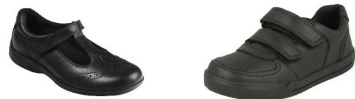
Wear school shoes that you can fasten yourself