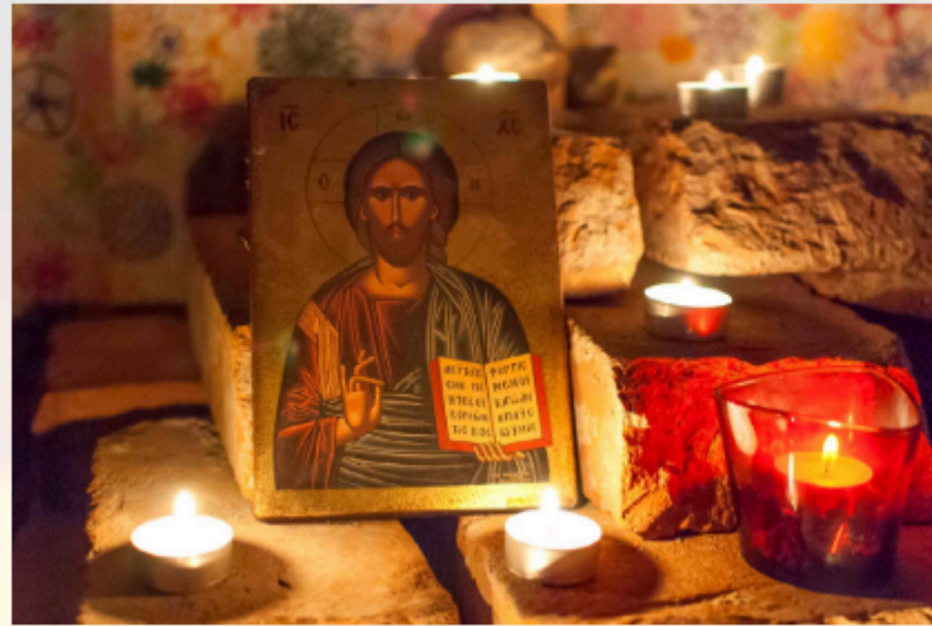
Icon light Jesus

In the week of the 17th of November, the daily prayers remind children that Jesus is always there for us. Inspired by the ' Litany of Trust ', children will remember that trusting Jesus releases us from our worries and helps us to face difficult challenges.