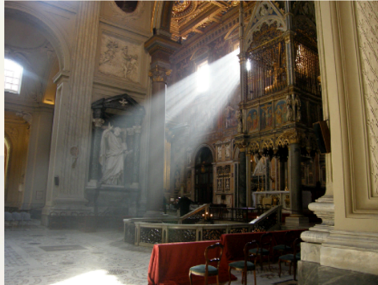
St John Lateran

The assembly for the second week in November highlights the Feast of the Dedication of the Lateran Basilica which holds a special place as the 'mother church' of the universal Catholic Church.